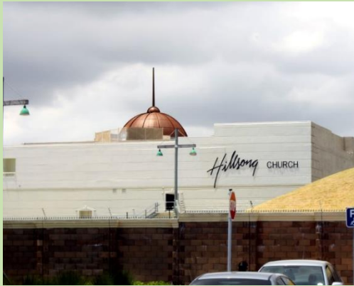
Hillsong Church in Cape Town, South Africa.

Here are some more examples of how churches around the world reflect the people who built them and who worships in them.